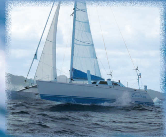
Cerulean - Atlantic 57 - Chris White Design - Built by ACC