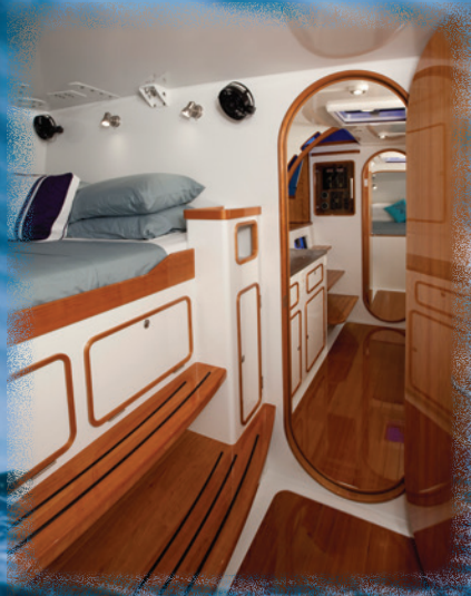
Cerulean Atlantic 57 Chris White Design Built by ACC